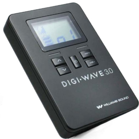
DLR 360 Receiver

The DLT 300 Transceiver features full-duplex capability, supporting up to four simultaneous talkers in two-way mode, and up to six simultaneous talkers in intercom mode. Slim, lightweight, and simple to set up and use. One- or two-way operation offers flexibility in an array of applications. With the push of a button, users can access two-way communication for immediate interaction or Q&A.