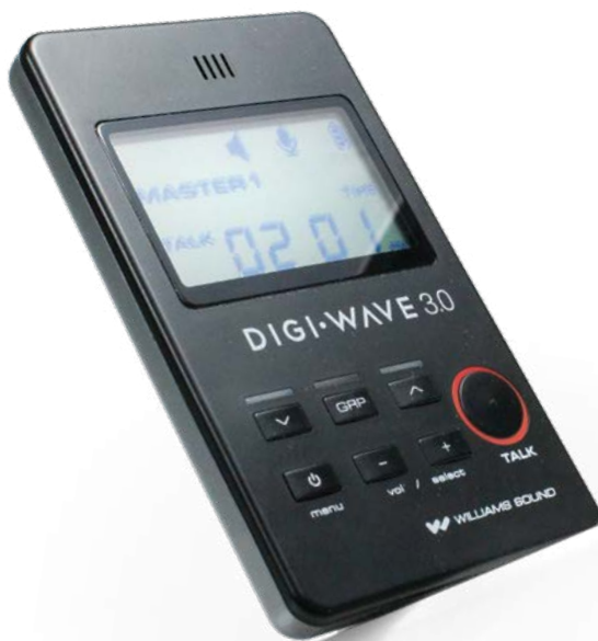
DLT 300 Transceiver