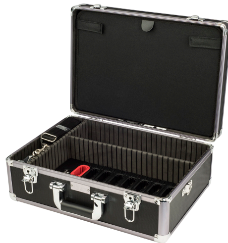
Docking Station Case 16 LA-481