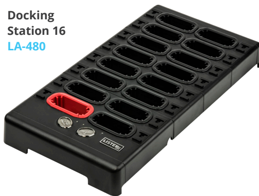
Docking Station 16 LA-480

Thank you for purchasing the ListenTALK Docking Station! For additional details on use, adjustment, or programming, download the full ListenTALK Operations Manual from www.listentech.com/support/manuals . To purchase accessories, visit: www.listentech.com/shop-listen .